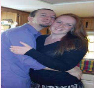
With Family Members