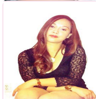
With Family Members