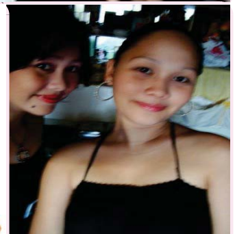
With Family Members