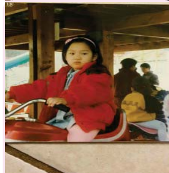
With Family Members