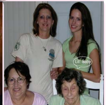
With Family Members