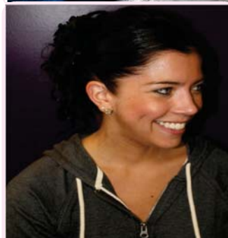
With Family Members