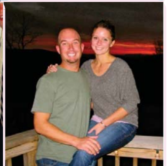
With Family Members