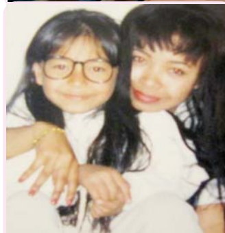
With Family Members