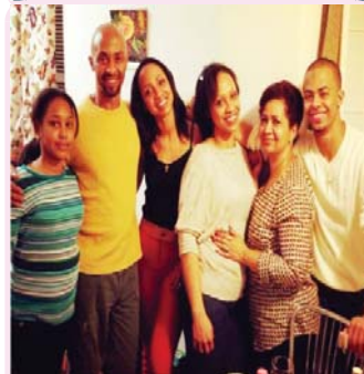
With Family Members