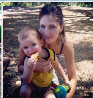
With Family Members