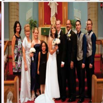
With Family Members