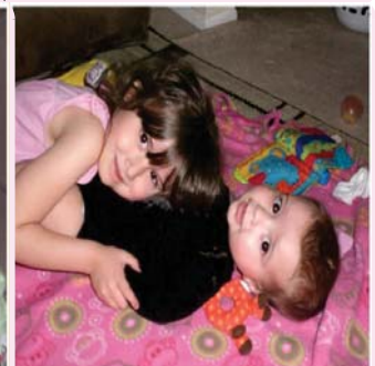
With Family Members