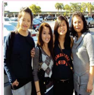
With Family Members