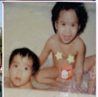
With Family Members