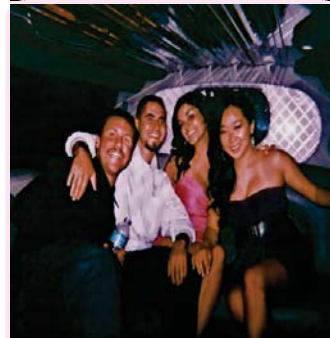
With Family Members